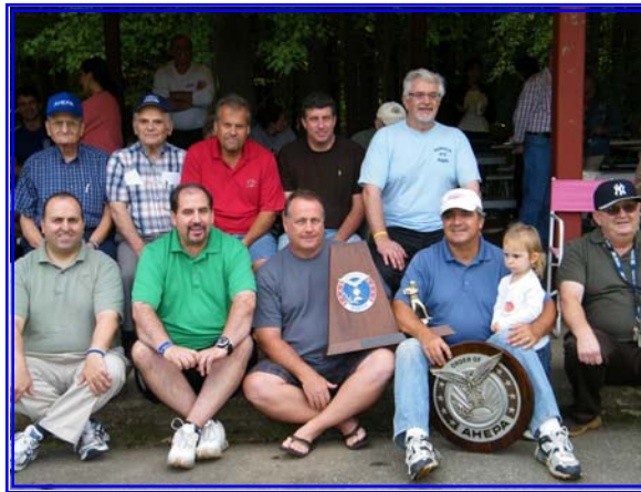
Norwich Chapter #110 Softball Team Reunion