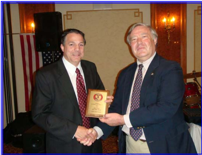
2010 District #7 Hellene of the Year— Senator Louis Raptakis